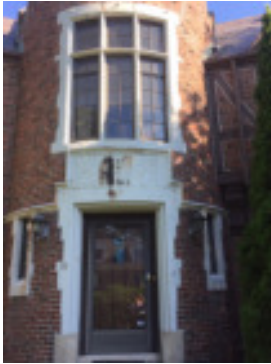
Figure 2. English Tudor Home (before)

Abbot's Small Projects Division recently completed a masonry restoration project at a distinguished English Tudor style home in Newton, MA. Built in 1930, this historic home is constructed of brick with precast concrete sills and ornamental stone work around the windows.